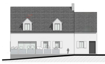
FACADE SUD OUEST