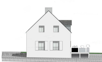
FACADE NORD OUEST