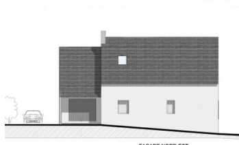
FACADE NORD EST