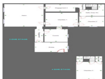
DÉTAIL DES SUPERFICIES :