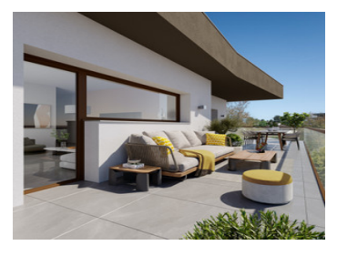
ENERGY - DPE

There are only a few remaining apartments in this developments, contact us now for further information.