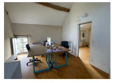
ENERGY - DPE