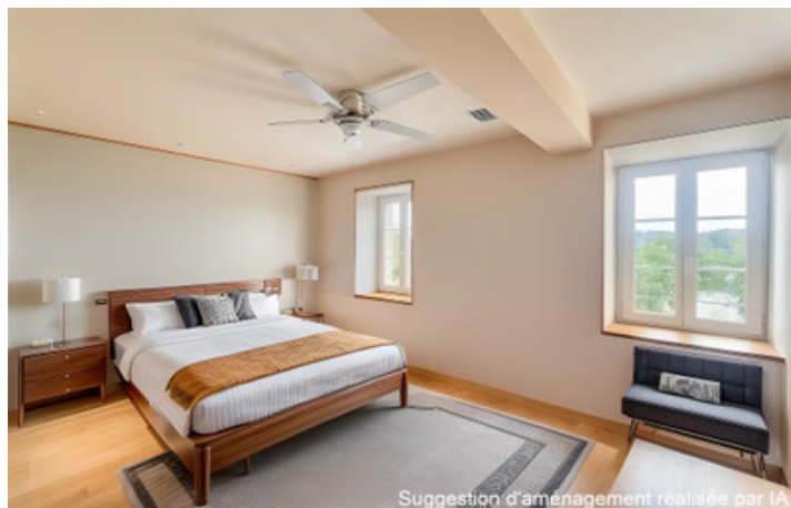
Suggestion d'aménagement réalisée par IA