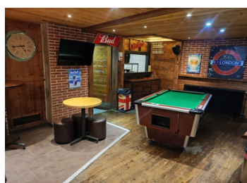
FNFRGY - DPF