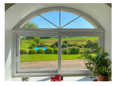
FNFRGY - DPF