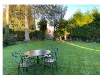
FNFRGY - DPF