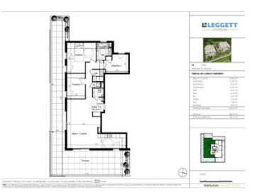
FNFRGY - DPF