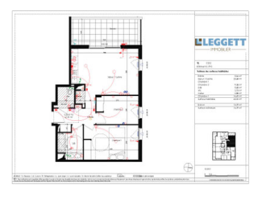
FNFRGY - DPF